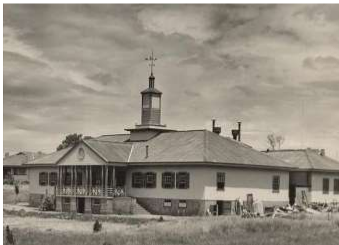
FAIRBRIDGE VILLAGE Nuffield Hall.